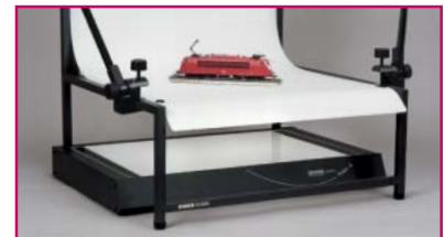
Kaiser soft light source for transmitted light and silhouetting. backlite 6000 (5463) for code # 5928/29 prolite basic 2 HF (2425) for code # 5997/98

All components are available separately.